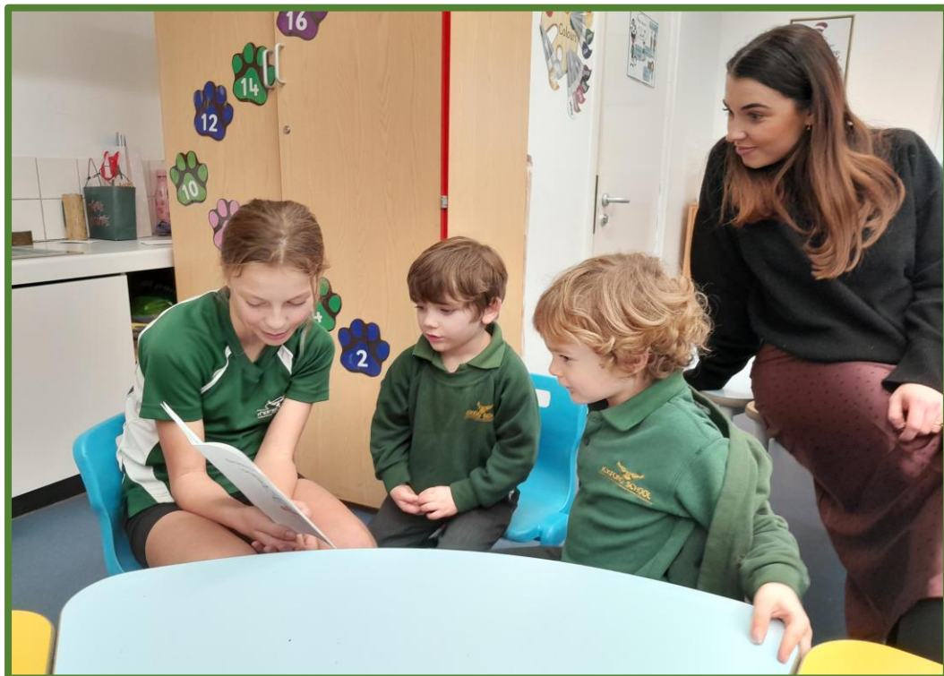
The children in Year 6 wrote, made and read books for the children in Class 1